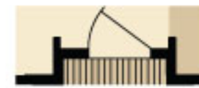
OPT. RECESSED ENTRY