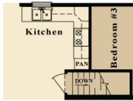
OPT. BASEMENT STAIRWELL LAYOUT